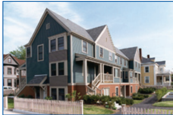
Images above are from the Cambridge (MA) Housing Authority, a successful MTW agency.