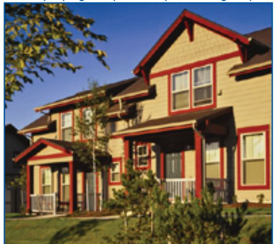
Photo shows the Salishan Neighborhood Revitalization for the Tacoma Housing Authority, a newly appointed MTW agency.

The Report to Congress: Moving to Work: Interim Policy Applications and the Future of the Demonstration can be found at: http://www.hud.gov/offices/pih/programs/ph/mtw/report-to-congress.pdf .