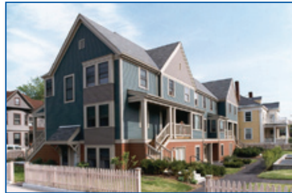
Images above are from the Cambridge (MA) Housing Authority, a successful MTW agency.